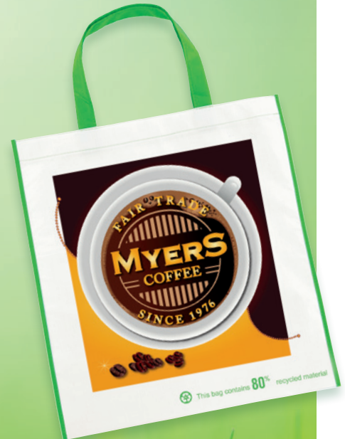
15476 Eco Non-Woven Tote Made from 80% post-consumer recycled material