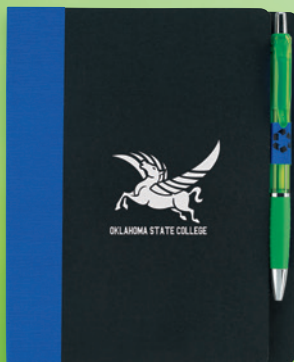
15693 5" x 7" ECO Notebook with Flags Paper sheets made from 30% recycled paper

Source: https://www.neilsen.com/us/en/insights/reports/2015/the-sustainability-imperative.html