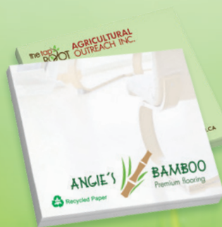
P3A3A25ECO BIC® Ecolutions® 3" x 3" Adhesive Notepad, 25 Sheet Pad Perfect for eco-conscious promotions, Ecolutions® Sticky Note® notepads contain 30% post-consumer fiber. Add the Mobius loop to your artwork for no charge.