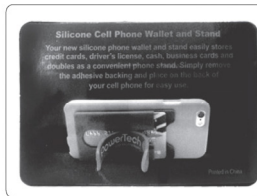
Instruction Card Included