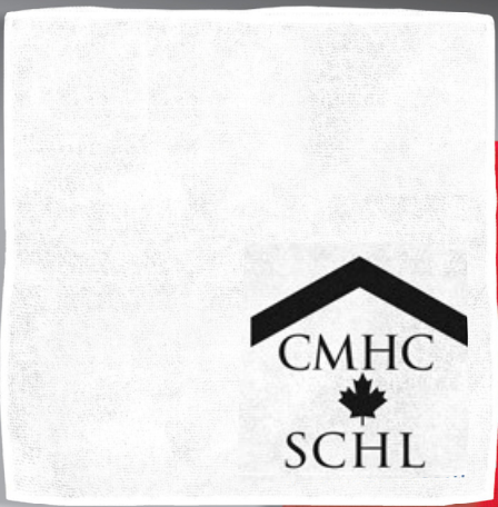
Standard Imprint Area Lower Right Corner